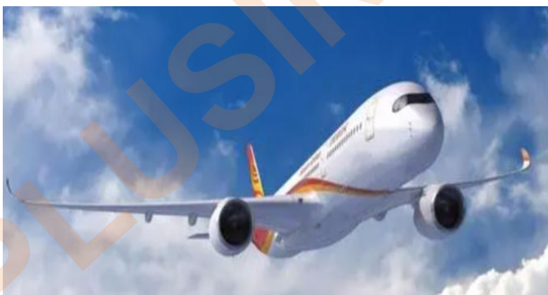
Air transport (No magnet/Lithium free battery)